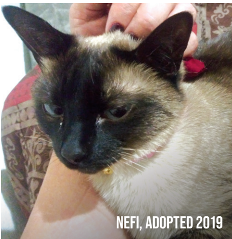
NEFI, ADOPTED 2019