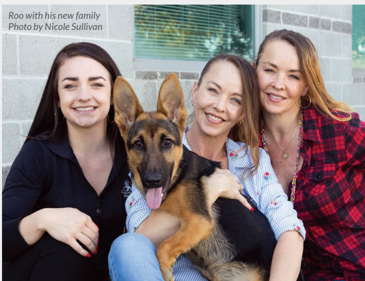
Roo with his new family