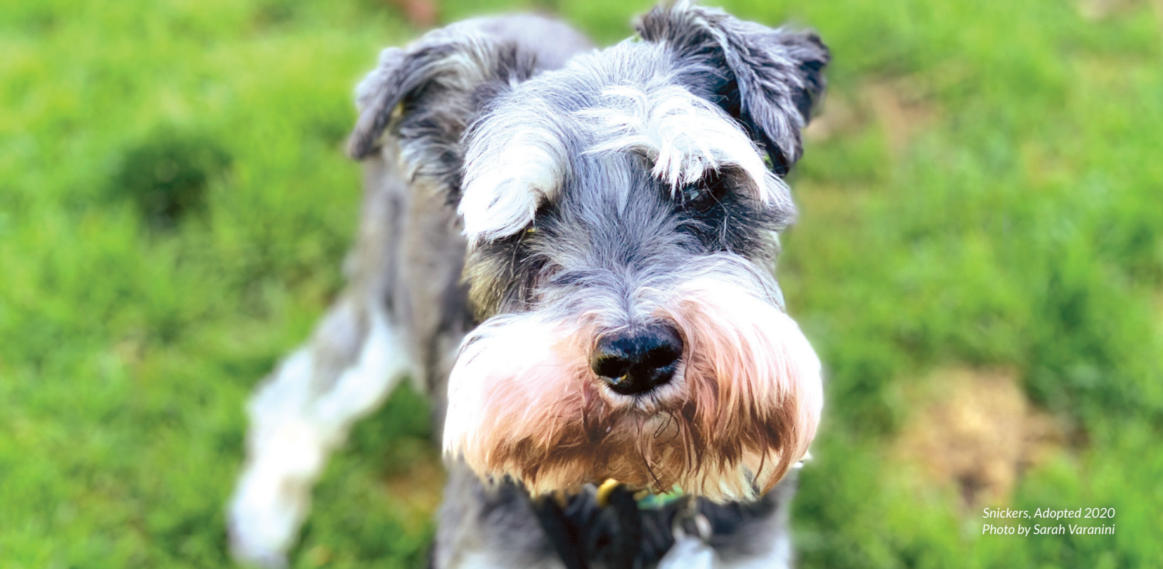
Snickers, Adopted 2020