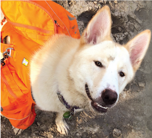
VOJJA, ADOPTED 2019

Please include his/her name, age and adoption date. You can even include a little blurb about how much you love your pet! We will feature some top photos based on quality in Heartbeats and on our social media pages.