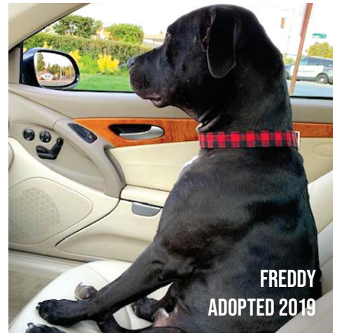
FREDDY ADOPTED 2019