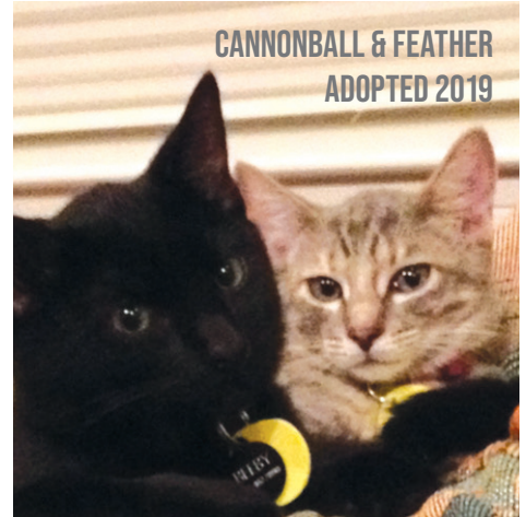
CANNONBALL & FEATHER ADOPTED 2019

We absolutely adore her and couldn't have asked for a more perfect addition to our little family.