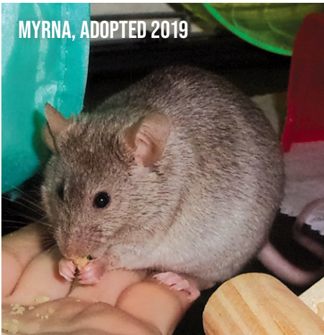
MYRNA, ADOPTED 2019