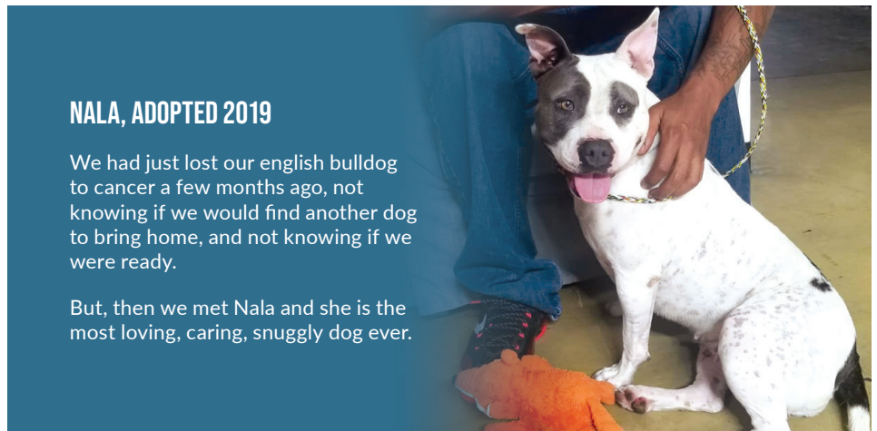
NALA, ADOPTED 2019

We had just lost our english bulldog to cancer a few months ago, not knowing if we would find another dog to bring home, and not knowing if we were ready.