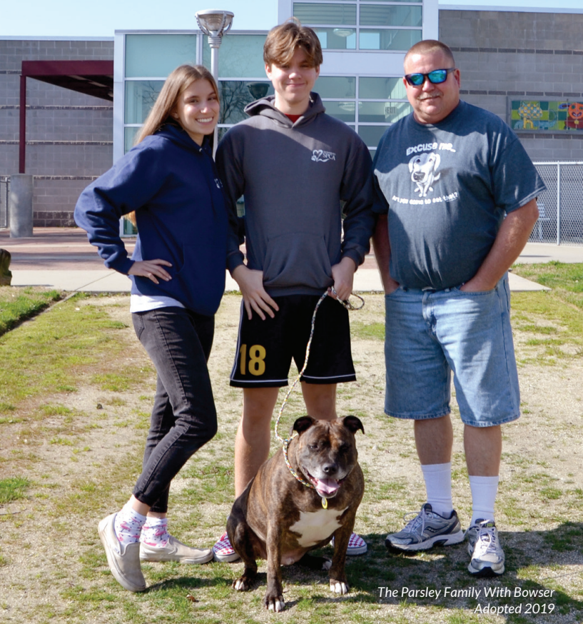
The Parsley Family With Bowser Adopted 2019